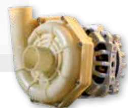
Highly efficient rinsing