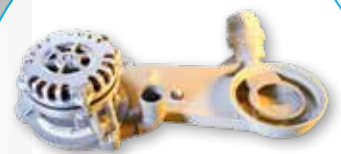
Highly efficient rinsing and draining