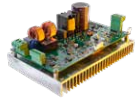
Controlling, regulating and monitoring